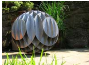
Outdoor light by Charlotte Tangye