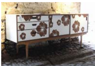
A Bit on the Side by Higher Market Studio