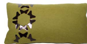
Flutterby cushion by Selina Rose