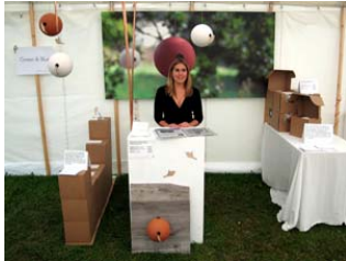
Green and Blue