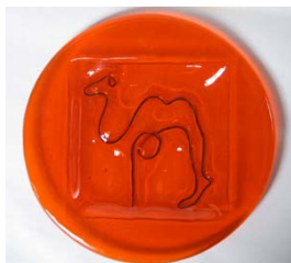
Picasso camel plate by Bryony Hughes-Lamb