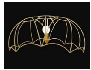
Wire frame lamp by Nick Fraser