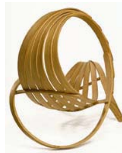
Chaise Longue No4 by sixixis